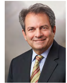
P2 - Panelist Michel Vounatsos Chief Executive Officer, Biogen