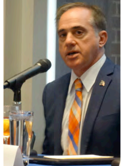
The Honorable David J. Shulkin, MD, discusses the VA initiatives aimed at helping veterans suffering from invisible wounds.